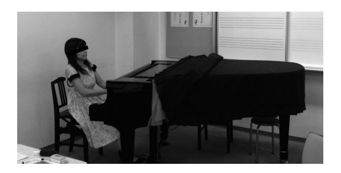
Fig. 1. Piano performance with blood flow restriction was performed while wearing pressure belts at the most proximal region of both arms.